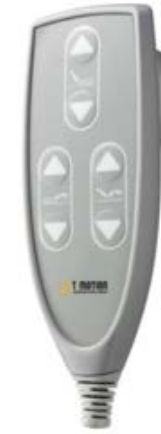
hand and foot controls