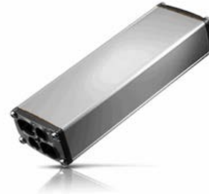
Battery with audible level indicator