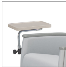
Swiveling side tablet

A molded plastic tablet with raised edges that folds flush on the side of the arm panel.