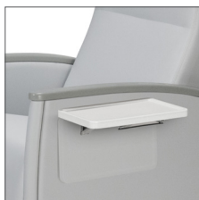
Folding side tablet

A molded plastic tablet with raised edges that folds flush on the side of the arm panel.