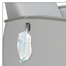
Drainage bag holder

Supports TV/DVD players and may be adjusted into a multitude of positions.