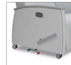
Central locking system

The heated seat and lumbar provides therapeutic warmth and eliminates the need of warming blankets. The optional massaging action provides three variations: wave, pulsating, and vibrating.