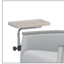
Swiveling side tablet

A molded plastic tablet with raised edges that folds flush on the side of the arm panel.