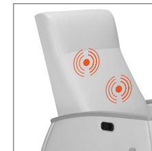
Heated seat and lumbar

A retractable loop for foley bags. It can be placed anywhere on the arm panel of the recliner.