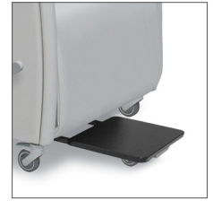
Rolling foot tray

Arm panel that can be folded to access the patient from the side of the chair. This is particularly useful for transferring patients to and from the bed.