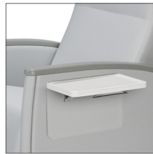
Folding side tablet

The profile tablet provides the patient with a generous and sturdy multi-purpose surface. When not in use it easily folds flush against the side of the chair.