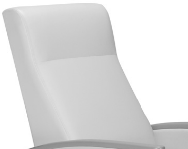
straight back 628-S