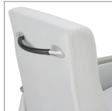
Softgrip push bar

A platform tucked under the seat that can be pulled out to provide a foot rest that moves with the recliner.