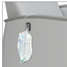
Drainage bag holder

Supports TV/DVD players and may be adjusted into a multitude of positions.