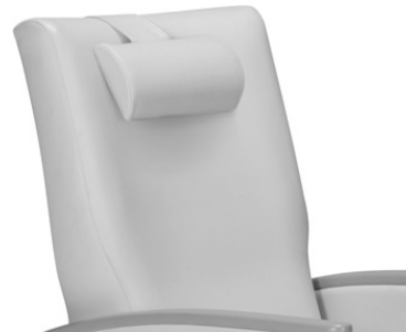
flared back 628-F