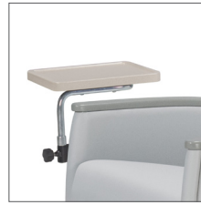
Swiveling side tablet

A molded plastic tablet with raised edges that folds flush on the side of the arm panel.